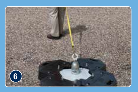
Ready to use in conjunction with a lanyard, self-retracting lifeline, or rope and rope grab