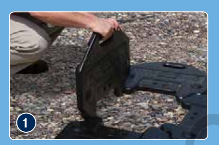
Align rubberised plates into square pattern using notches