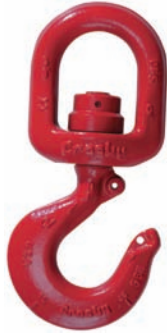
Suitable for frequent rotation under load.