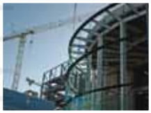
Construction & Building Maintenance