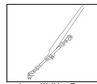
Lever Snubbing Type