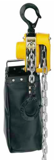
Option: Chain container