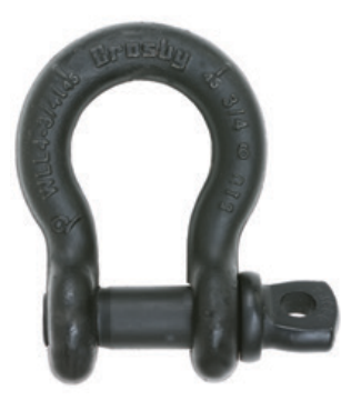
S-209T THEATRICAL SHACKLE