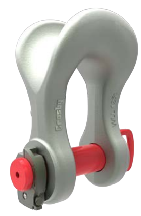
G-2170 Grommet Shackle